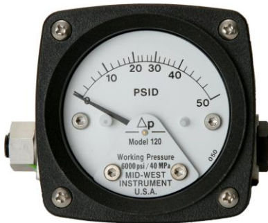
Model 120 0-50 PSID 2-1/2" Dial

A low-cost differential pressure gauge for use in measuring the pressure drop across filters, strainers, separators, valves, pumps, chillers, etc., and for local flow indication and control.