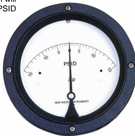
Model 120 15-0-15 PSID 4-1/2" Dial Bi-Directional